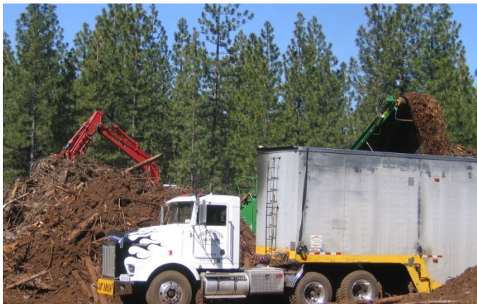
Grind & Haul Waste