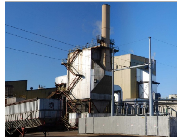
Controlled Energy Creation