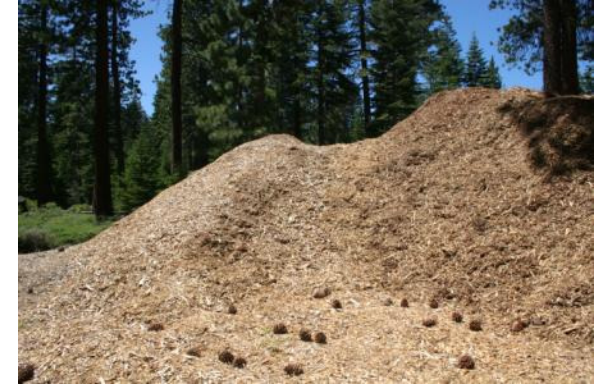
Regional biomass collection