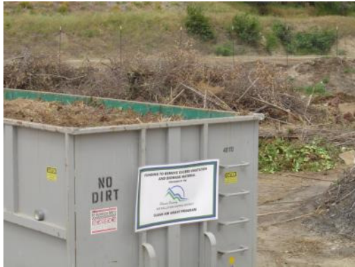
Community biomass collection