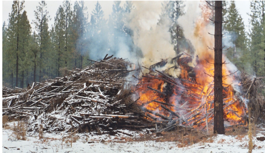
Large amounts of Air Emissions